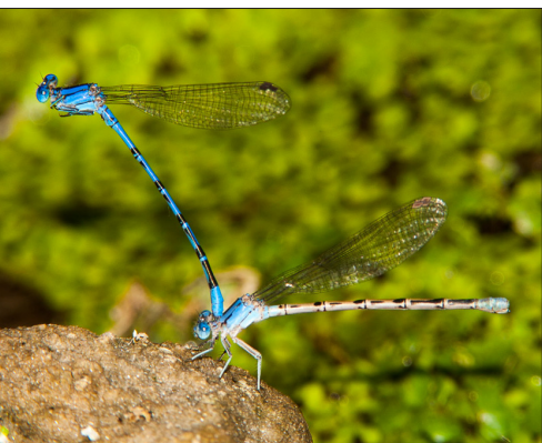
Springwater Dancer ( Argia plana ) pair in tandem.

Dragonflies use a variety of techniques to deposit their eggs. Female damselflies and some dragonflies have a well-developed ovipositor that injects eggs into plant tissue, while other dragonflies simply drop their eggs in or near water. Females of some species tap their abdomens repeatedly on the water to lay eggs extruded in a ball at the tip, while those of other species lay eggs on dry land in seasonal wetlands that flood later. One female can lay thousands of eggs, scattering them over a wide area to increase the likelihood that eggs and nymphs will survive.