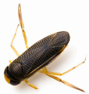
True bugs like this water boatman ( Corixidae ) are beneficial inhabitants of ponds and other still waters.

It will take some time for the plants and animals in your pond to become fully established—be patient! A greater abundance of algae for the first six months is not unusual; this gives the water a green color but is not harmful. Algae problems clear up as the aquatic plants mature, as the growing plants cool the water and take up the excess nutrients that help algae thrive. Use of floating plants such as duckweed and azolla in the first year will help decrease the amount of light available for algae to grow.