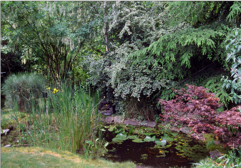
A constructed backyard pond nine years after establishment.