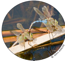
Floating vegetation for oviposition & perching