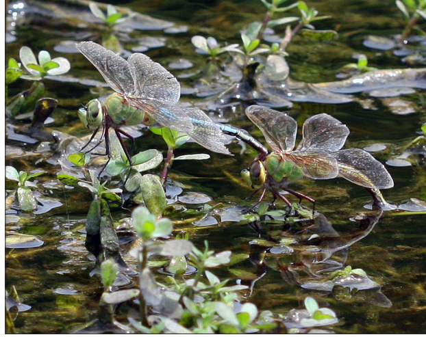
A variety of aquatic vegetation can help control algae while providing areas for odonates to perch as well as lay their eggs.

The pond is now ready to be planted. A diversity of vegetation in and around the pond will offer a variety of food and cover for wildlife. Recommendations include total vegetation cover of 50–70%, consisting of 5% emergent, 10–25% floating, and 25–50% submerged plants, with areas of open water maintained. Plants can be set in mesh baskets or plant pots at the desired location and depth. Use soil with substantial clay content, as planting mixes will float. A layer of gravel on top of the pot will help prevent soil from floating out. The area at the pond margin and up to a few meters away should be planted with grasses, sedges, forbs, and shrubs, but leave one or more paths and small “beaches” for ease of observation and maintenance, and to facilitate pond access by small wildlife. Consult your local garden store or native plant society to find out what native species are appropriate and available in your area.