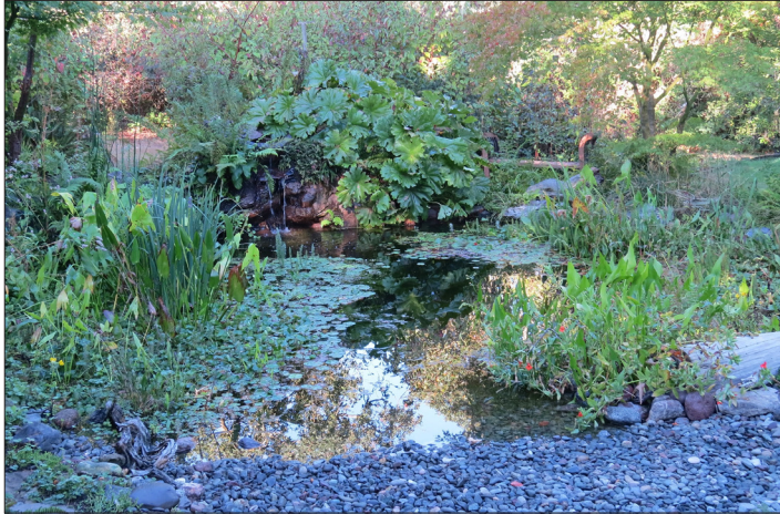
A constructed backyard pond like this one in California can function as an urban oasis to a host of wildlife.

Water is the driving force of all nature. — Leonardo Da Vinci