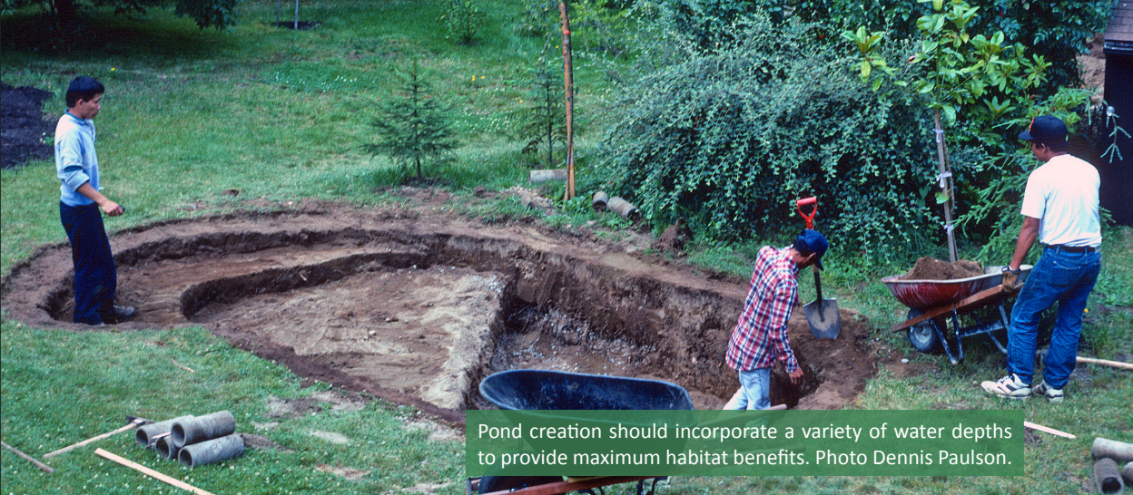
Pond creation should incorporate a variety of water depths to provide maximum habitat benefits.

ensures plant diversity both in and around the pond. Your pond may also need an outlet to direct any overflow that could result during periods of heavy rain. An overflow outlet can be artificial, i.e., a piece of pipe placed at the top of one edge of the pond to direct overflow to a desired area of the yard, or it can look more natural, i.e. a shallow rock-lined channel that directs overflow away from the pond.