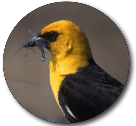
A Yellow-headed Blackbird catches two Pacific Forktails ( Ischnura cervula ).

Despite being predators, adults and nymphs fall victim to a variety of animals, and are an important part of both aquatic and terrestrial food webs. Birds eat dragon-