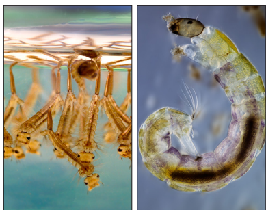
Photo on left, mosquito larvae; photo on right, non-biting midge larva.

Mosquito production can be a concern to pond owners or their neighbors. Once the pond is established it may produce few or no mosquitoes, as populations are controlled by dragonfly and damselfly nymphs and other predatory aquatic invertebrates such as copepods, water bugs, and diving beetles. Your pond may also be home to vertebrate wildlife such as frogs