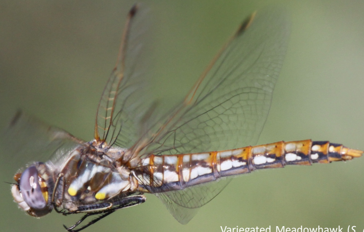
Variegated Meadowhawk ( S. corruptum ) in flight.