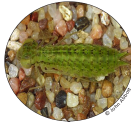
Substrate & refuge for nymphs