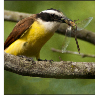
Great Kiskadee making a meal of a Common Green Darner ( Anax junius ).

D ragonflies and damselflies play important roles in aquatic and terrestrial habitats. Nymphs eat a variety of aquatic invertebrates, including mosquito and midge larvae, as well as small fish and tadpoles, and can be top predators in fishless ponds. Odonate nymphs are food for fish and amphibians, and adults are eaten by upland predators such as birds, bats, lizards, and spiders. Odonates can serve as indicators of different types of aquatic habitats and provide information about the biological health and diversity of a habitat.