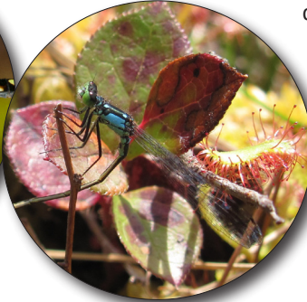
A Pacific Forktail ( Ischnura cervula ) falls victim to a carnivorous sundew plant ( Drosera sp.).

flies in great numbers, especially during the breeding season when they feed their young on tender teneral. Bats eat them at dusk, frogs and fish jump out of the water after adults, spiders catch them in webs or hunt them down, lizards and robber flies stalk them in the uplands, and they will also hunt and eat each other.