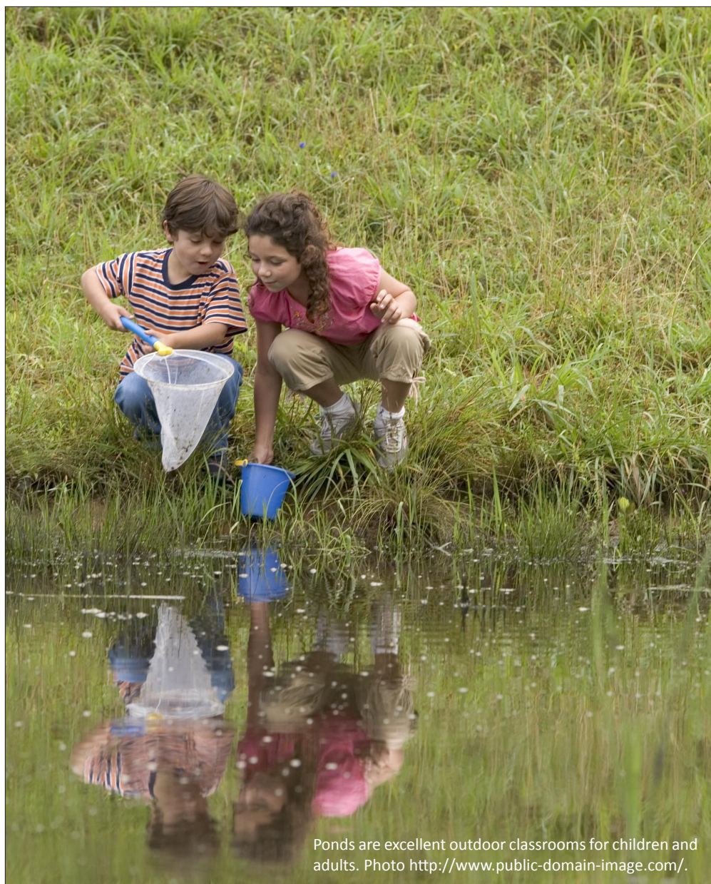
Ponds are excellent outdoor classrooms for children and adults.

Urbanization has been suggested to lead to odonate communities composed of common generalist species. However, in a landscape where wetlands are degraded or destroyed, even common species can decline, and pond habitats designed with the needs of dragonflies in mind, including a variety of water depths and aquatic and edge vegetation, can increase occurrence of regionally rare species as well as generalists. In Yokohama, Japan, where urbanization and industrialization destroyed much wetland habitat, re-design of a concrete-lined ornamental fish pond that was previously inhabited only by three common species of odonates allowed it to be used by a total of 27 species. The success of this project spurred restoration of many other similarly degraded ponds in the area and these created ponds are now used as outdoor classrooms for children to learn about dragonfly ecology and conservation.