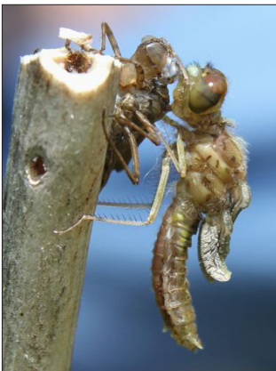
Photo on left, a dragonfly splits its nymphal skin to emerge; wings still rumped prior to unfurling. Photo on right, a newly emerged (teneral) Variegated Meadowhawk ( Sympetrum corruptum ) displays a distinct shine on its recently unfurled wings.

This newly emerged adult, called a teneral, has shiny wings, weak flight, and hardly any pigment. The first flights of tenerals may take them a long distance from the water, where they quickly develop their definitive color pattern (though still not fully mature coloration). The adult may stay in a sexually immature stage for a few days to several months, remaining away from the water and concentrating on feeding as it matures.