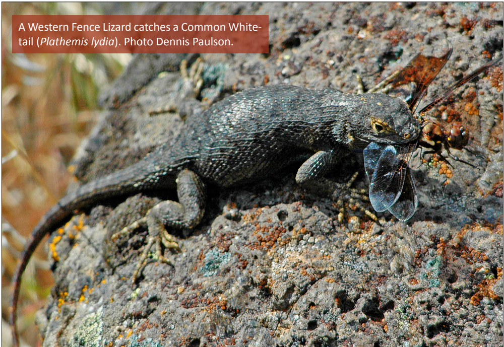
A Western Fence Lizard catches a Common White-tail ( Plathemis lydia ).

flies in great numbers, especially during the breeding season when they feed their young on tender teneral. Bats eat them at dusk, frogs and fish jump out of the water after adults, spiders catch them in webs or hunt them down, lizards and robber flies stalk them in the uplands, and they will also hunt and eat each other.