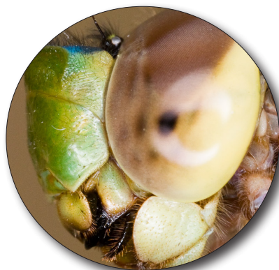
Head of a Common Green Darner ( Anax junius ).

Odonate vision is the best in the insect world. The large eyes provide a wide visual field that allows the insect to see everywhere except directly behind its head. Each compound eye consists of up to 30,000 simple eyes (ommatidia) that give a mosaic view, and can detect movement, shape, and UV and polarized light. Excellent eyesight makes it relatively easy for an odonate to spot prey in the air or on vegetation.