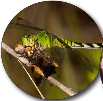
Eastern Pondhawk ( Erythemis simplicicollis ) eating an Eastern Amberwing ( Perithemis tenera ).