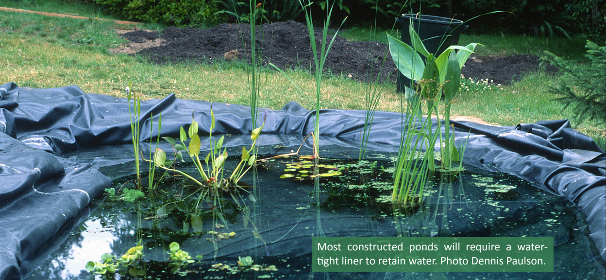
Most constructed ponds will require a water-tight liner to retain water.

ing and planting. If you anticipate entering the pond to perform maintenance, you may want to create steps leading into it at one edge, as an algae-coated pond liner can be very slippery. Steps can be created by stacking sandbags under the liner.