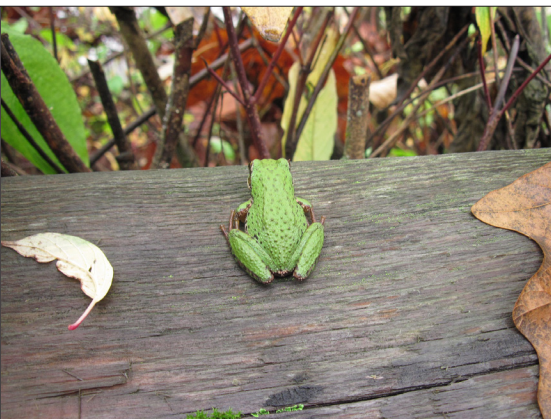
Logs placed near pond edges provide perches and safe routes into and out of the pond for visiting wildlife like this Pacific Chorus Frog.

It is not recommended to stock the pond with fish, as they prey on dragonfly and damselfly nymphs as well as other aquatic invertebrates that the nymphs rely on for food, and their wastes contribute additional nutrients to the water, which can decrease water quality and increase algal blooms. Ponds with fish can support stable odonate populations, but be aware that when fish are present production of adults may be decreased and the overall odonate community composition altered. If you want fish as a part of your pond community, consult your local natural resource experts to see what small native fish in your area might be good pond citizens.