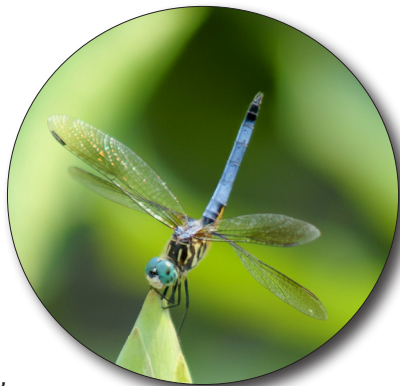
A Blue Dasher ( Pachydiplax longipennis ) obelisking.

An odonate's body temperature is controlled by air temperature. On a cool morning, a dragonfly may rest perpendicular to the sun's rays to warm itself, often on a pale surface that reflects sunlight onto its body. Some whirl their wings to warm their muscles enough to lift into flight. To avoid overheating, some odonates seek shade when their body temperature reaches a critical point, while others perch with their abdomen pointing up at the sun (obelisking) at midday or hanging down below them to reduce sun exposure.