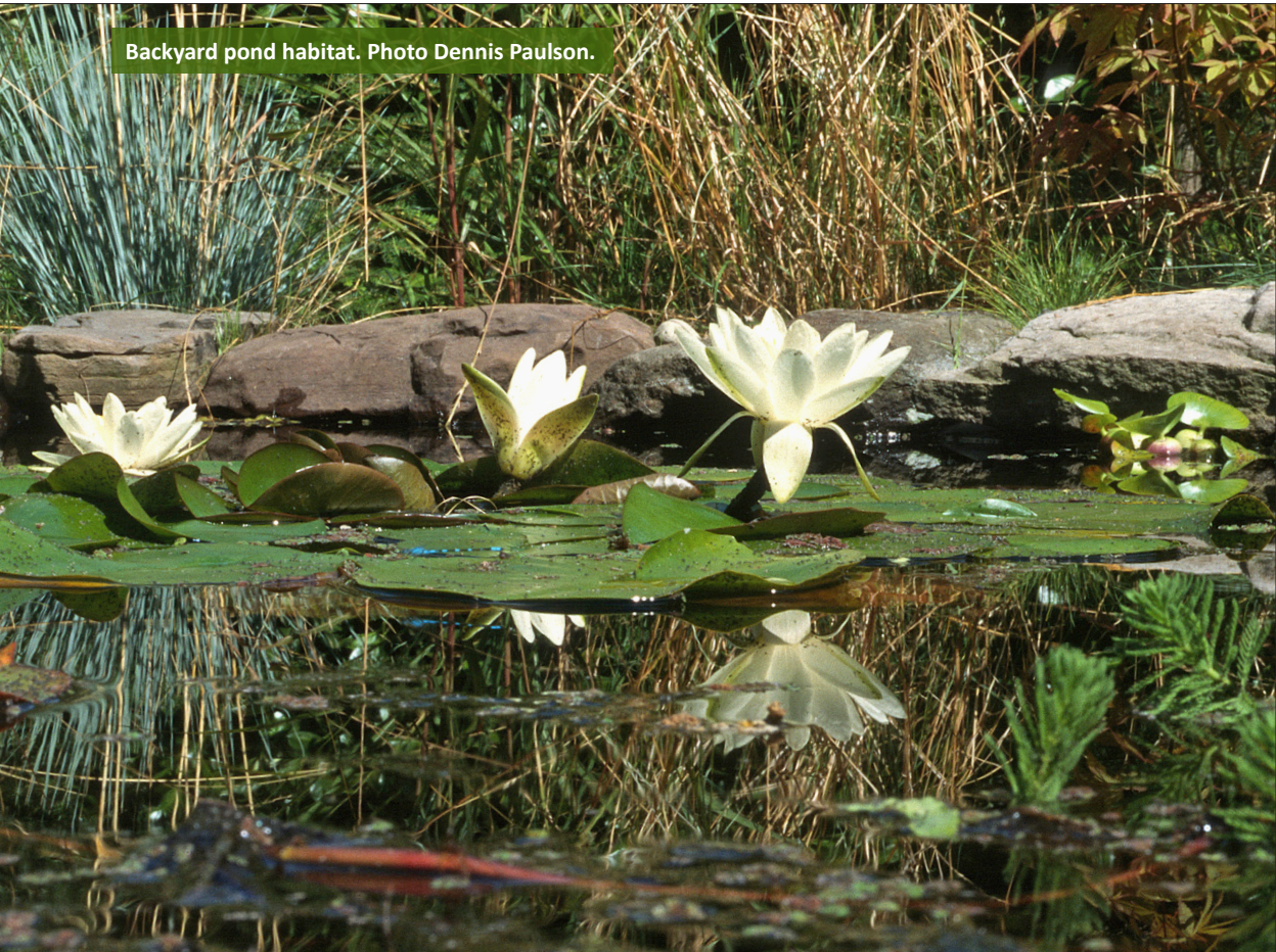
Backyard pond habitat.