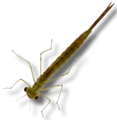
Damselfly nymphs have 3 leaf-like gills at the end of the abdomen that also aid in swimming.

Depending on the species, nymphal development takes a month to several years, and nymphs will molt (shed their skins) a dozen times as they grow. The adult develops within the final-stage nymph. When adult emergence is near, the nymph stops feeding and comes to the surface to breathe, then finally crawls up on the shore or a convenient stem, leaf, or rock. There, it splits its skin and within a few hours emerges as an adult, which looks quite rumped until the wings expand and the body hardens.