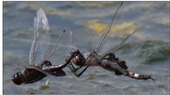
Black Saddlebags ( Tamea lacerata ) in tandem linkage, cruising over a pond.

You may see dragonflies and damselflies investigating or even laying eggs in your pond as it is being planted, but be aware that development of nymphs to adults may not occur in the first year. If the nearest wetland is more than a few miles away, it will take longer for new colonists to find your pond. A bucket or two of water and mud taken from a nearby pond or wetland will seed your pond with naturally-occurring aquatic invertebrates and plants, but be sure not to venture too far afield to avoid introducing species that are either non-native or not adapted to your local conditions.