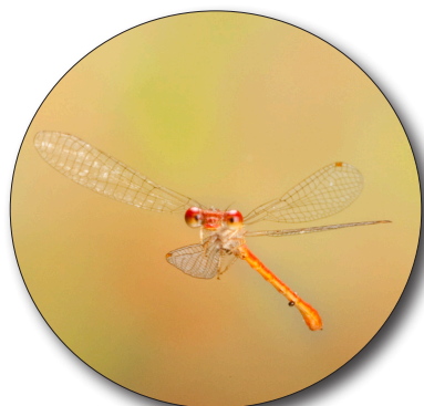
Desert Firetail ( Telebasis salva ) male in flight.

Dragonflies and damselflies are accomplished fliers whose complex wings are perfectly structured for their intricate flight maneuvers. Not only does each pair of wings work independently of the others, but so does each wing. Dragonflies can fly at about the same speed as small songbirds (30 mph/48 kph), stop suddenly and hover, make instantaneous right-angle turns, shoot straight up in the air and even back up for a short distance.