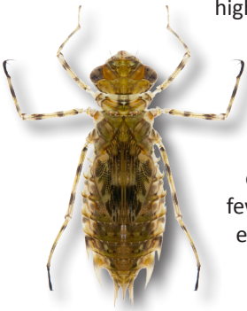
Dragonfly nymphs have 3 stout spines at the tip of the abdomen, which houses an internal rectal gill chamber.

O donate nymphs look nothing like the colorful aerial adults. Dragonfly nymphs are dull in color but come in a variety of shapes and sizes, such as sleek and streamlined, broad and flattened, and torpedo-shaped. These and other body shapes allow nymphs to lurk, burrow, or glide through vegetation, depending on the species. The abdomen is tipped with three short, stout spines surrounding a rectal gill chamber used to obtain oxygen from the water. Damselfly nymphs are minnow-like, with long, slender bodies tipped with three leaf-like gills that also help them swim. All are voracious predators, with a remarkable hinged, toothed lower lip that shoots out at high speed to snatch their prey.