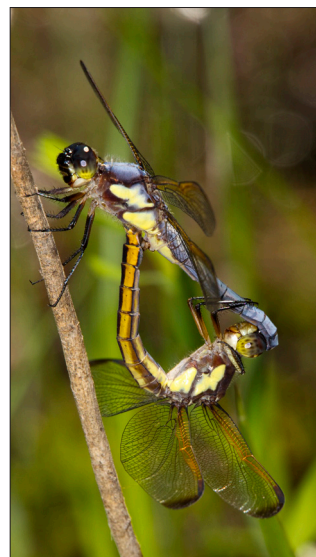
Yellow-sided Skimmer ( Libellula flavida ) pair in mating wheel.